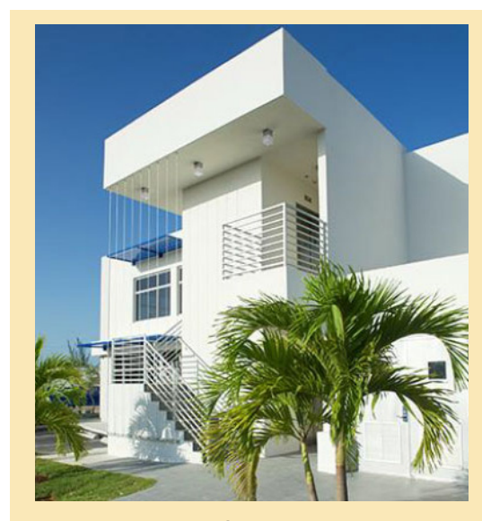
SWP's secure storage facility George Town, Grand Cayman

Strategic Wealth Preservation (SWP) is an international precious metals dealer and secure storage provider headquartered in the Cayman Islands. We specialize in the acquisition and secure storage of precious metals for individuals, companies, trusts and wealth management professionals on behalf of their clients. We deliver precious metals worldwide to homes and businesses and offer secure storage in vaults located in the Cayman Islands, Canada, the United States, Switzerland, Liechtenstein, Singapore and New Zealand. We also offer corporate disaster recovery services for businesses located in the Cayman Islands.