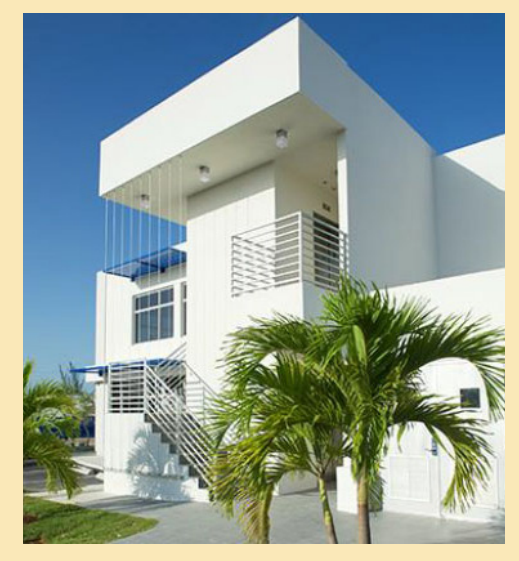
SWP's secure storage facility George Town, Grand Cayman

Strategic Wealth Preservation (SWP) is an international precious metals dealer and secure storage provider headquartered in the Cayman Islands. We specialize in the acquisition and secure storage of precious metals for individuals, companies, trusts and wealth management professionals on behalf of their clients. We deliver precious metals worldwide to homes and businesses and offer secure storage in vaults located in the Cayman Islands, Canada, the United States, Switzerland, Liechtenstein, Singapore and New Zealand. We also offer corporate disaster recovery services for businesses located in the Cayman Islands.